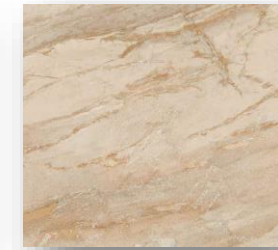
Light Brown AE03