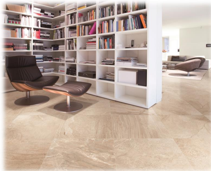
Light Brown AE03 shown in a grid pattern.

A striking emulation of authentic Aegean stone, this series captures the dramatic natural beauty of the Greek Islands. The bold stone visual is balanced with a versatile, traditional color palette that lends itself to modern design. Available in 18" x 36", 24" x 24", 12" x 24" and a 2" x 4" mosaic, this series also includes a 6" x 12" Cove Base, 4" x 12 Bullnose, 1" x 6" Cove Base Corner and two finishes: Matte and Polished.