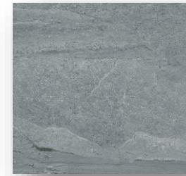
Dark Gray AE04