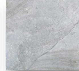
Light Gray AE02